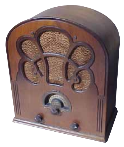
Fi se w ar ur Cr